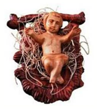
Hail and blessed be the

hour and moment in which the Son of God was born of the most pure Virgin Mary, at midnight, in Bethlehem, in the piercing cold. In that hour vouchsafe, I beseech Thee, O my