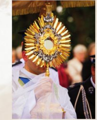
All are welcome to join the Corpus Christi Procession at the end of 5:00PM Mass in the Church.