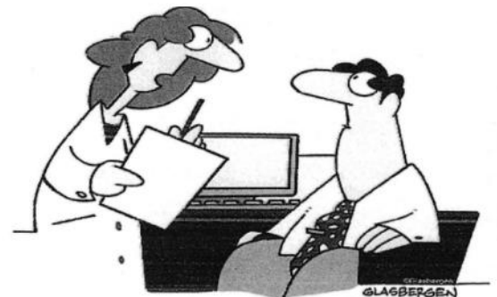
"You are a type 8 diabetic. That's a type 2 with 4 times more excuses than the average patient."