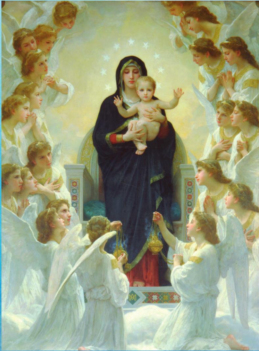
The Virgin with Angels, William-Adolphe_Bouguereau, 1900. Public Domain.

January 1, 2023 | Solemnity of the Blessed Virgin Mary, the Mother of God