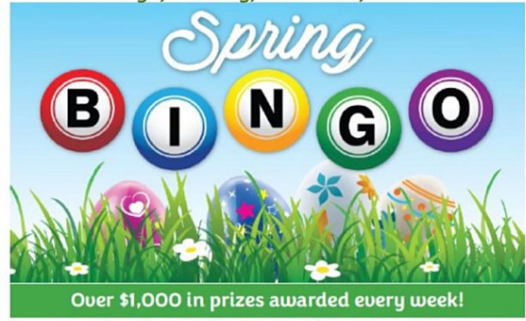
Every Thursday in the Parish Center * Doors open at Noon * Complimentary Donuts and Coffee *

We are mindful that there are some, who due to health, need to wear a mask. We have masks available in the back of the Church if you need one. Low gluten hosts or regular hosts will be available during Communion at the back of the Church. Please let the minister know that you wish to receive a low gluten host when you approach them for Holy Communion. The minister distributing low gluten hosts will continue to wear a mask for those who might have a concern for their health.