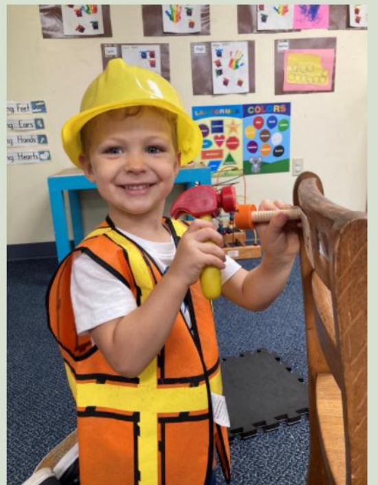
A faith filled beginning!

Registration is now taking place for the 2023-24 school year. St. Jerome ECC offers a faith-filled, developmentally appropriate, and nurturing Catholic environment for children ages two, three, and four. St. Jerome ECC is fully accredited by NAEYC and is a Gold Seal school. Full or part day programs are available. St. Jerome ECC is a VPK provider for four-year olds.