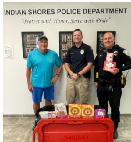
INDIAN SHORES POLICE DEPARTMENT "Protect with Honor, Serve with Pride"