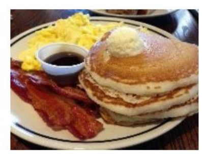
KOC Pancake Breakfast

Rosary for Life at the Grotto immediately following the Saturday, Oct 7th, 5:30PM Mass Sponsored by the Life Ministry