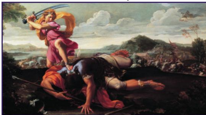
Guillaume Courtois - David and Goliath

"...and David picked up five smooth stones..." (1 Samuel 17:40)