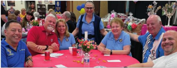
The Columbiettes thank everyone who participated in and contributed to the Trivia Night fundraiser!

Do you want to assist those in need in our parish and community? Are you willing to work with our Knights of Columbus Council and their charitable commitments? Consider joining our growing Columbiettes Auxiliary. We are developing our own projects and fundraisers, and guess what--we're having fun, too!