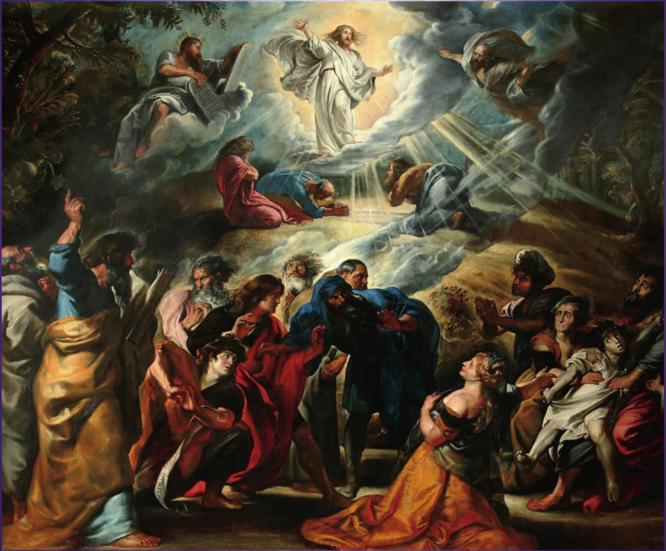
The Transfiguration of Christ, Peter Paul Rubens (1577–1640), public domain.